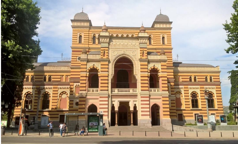
Tbilisi Opera and Ballet State Theatre, Tbilisi, Georgia

Literature and the lively arts are cousins in Georgian Culture.